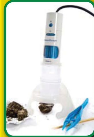
Owl Pellet with SmartMicroScope Cradle (P/N S323)