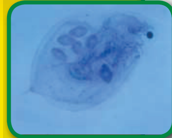
Daphnia (Water Flea) Prepared Slide at 200x Magnification