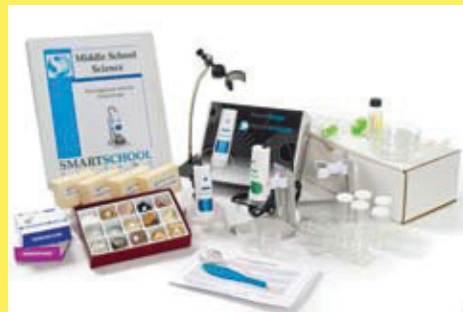
Middle School Kits