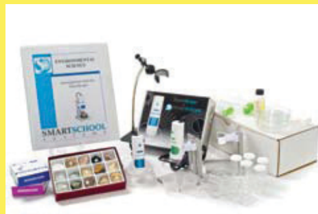
Environmental Science Kit