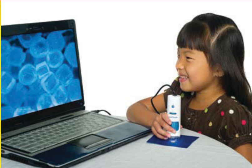
Salt Crystals at 200x Magnification with the SmartMicroScope (P/N S215)

SMARTMICROSCOPE kits are versatile and easy to use.